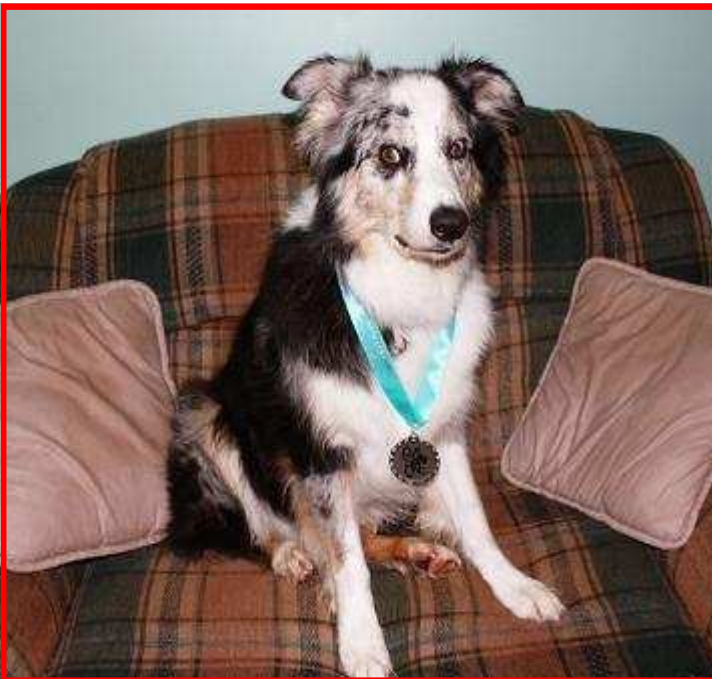
Tugboat models the new ATCH II medallion

We'll do our best to have these awards at future ASCNE agility trials!