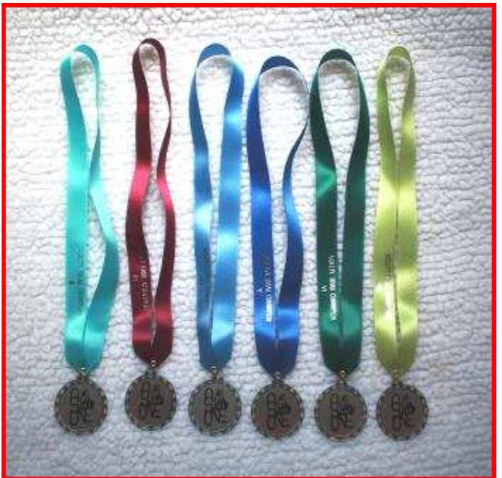
ATCH II through ATCH V II medallions now available!